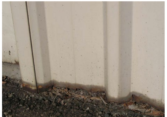
Figure 2. Corrosion due to inappropriate wall design

The consequence of not maintaining a free drip edge may be premature corrosion. This is due to the retention of moisture at the cut edge of the steel when in contact with other materials. Bricks, pavers, concrete slabs and even other metallic products may contribute to this mechanism when installed incorrectly. Please refer to Figure 2 for an example.